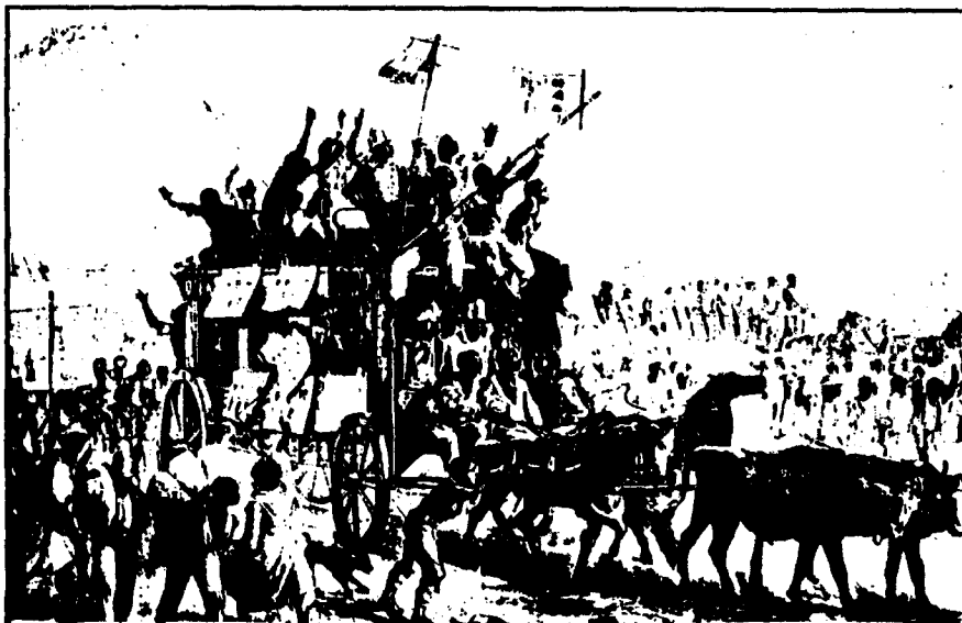
In liberated areas of the South, black people openly celebrated the Emancipation Proclamation; in areas still controlled by Confederate Forces, Loyal Leagues were organized to spread the news of freedom secretly from plantation to plantation. Engraving from Le Monde Illustré courtesy of Chicago Historical Society.

This single event, more than any other, broke the grave-like silence of the Cold War years and sounded the call for the youth who were suffocating under the enforced dullness and conformity of that period. It was followed by the Freedom Rides, in which Blacks and whites got on south-bound buses in the north and refused to rearrange their seating when the buses crossed into the segregated south. In 1960 came the first sit-in, organized by southern Black students. In 1964 came Freedom Summer, when thousands of northern Blacks and whites went to Mississippi to assist in the voter registration campaign under way there under the auspices of the Student Non-Violent (later National) Coordinating Committee (SNCC). When two young whites and a Black were brutally murdered by white racists, the plight of southern Black people was brought to national attention for the first time in nearly a century, and the conscience of the country was for a moment stirred. Later that year, the Mississippi Freedom Democratic Party, based among Blacks in the state who were still denied the right to vote, attempted unsuccessfully to unseat the state's regular delegation to the national convention to the Democratic Party. Out of the experience of the southern freedom movement grew the northern student movement represented by the Students for a Democratic Society (SDS). There