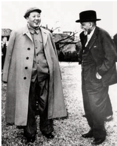
W. E. B. Du Bois with Mao Zedong at Mao's villa in south-central China, April 1959.

More than a decade before Brown and Newton set foot on Chinese soil, W. E. B. Du Bois regarded China as the other sleeping giant poised to lead the colored races in the worldwide struggle against imperialism. He had first traveled to China in 1936—before the war and the revolution—during an extended visit to the Soviet Union. Returning in 1959, when it was illegal to travel to China, Du Bois discovered a new country. He was struck by the transformation of the Chinese, in particular what he perceived as the emancipation of women, and he left convinced that China would lead the underdeveloped nations on the road toward socialism. "China after long centuries," he told an audience of Chinese communists attending his ninety-first birthday celebration, "has arisen to her feet and leapt forward. Africa arise, and stand straight, speak and think! Act! Turn from the West and your slavery and humiliation for the last 500 years and face the rising sun." 5